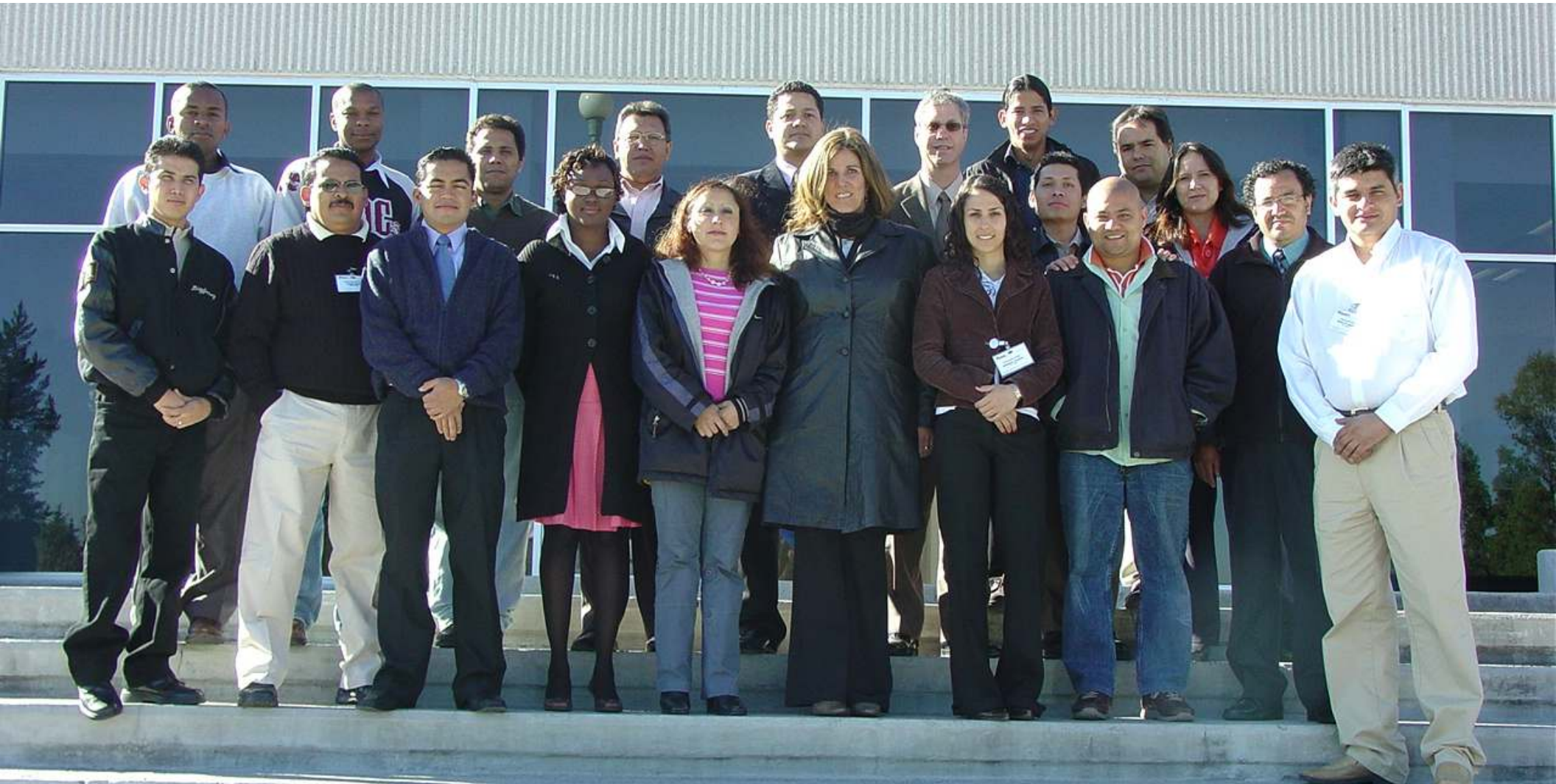
Workshop on Hydrometer Calibration, November 21 to 23, 2006, Querétaro, México.